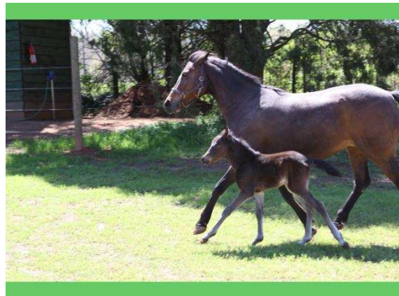
Minuet and Cocoa

Pony Club is all about building a partnership with our ponies, and this month was no exception. As the weather was incredibly warm, we took advantage and bathed loads of ponies after riding! Next month will be a big month. We will be having our first rating!! Our mock rating is schedule for the 9 th , an unmounted meeting on the 13 th and our rating on the 16 th . Good luck to all of those who will be participating, and thank you to all the volunteers that make it happen.